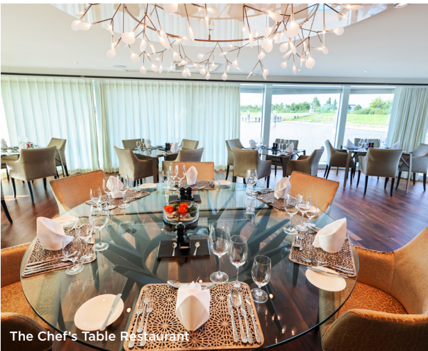
The Chef's Table Restaurant

AmaWaterways' twin-balcony ships represent some of the newest vessels in our fleet. Heated pools with a swim-up bar provide a tranquil environment for viewing stunning mountains and spired skylines. Plus, spacious staterooms afford guests comfort and privacy to rejuvenate while still experiencing the magnificent scenery.