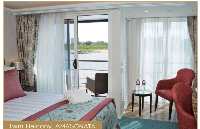
Twin Balcony, AMASONATA