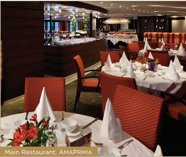
Main Restaurant, AMAPRIMA

Experience the Danube, Rhine or Moselle rivers aboard AmaWaterways' spectacular twin-balcony ships! A walking track, heated swimming pool and fleet of bikes allow you to trek, float or glide alongside majestic hills, castles and town squares. And elegantly appointed staterooms envelop you in comfort so you can recharge for another captivating day of European discovery.