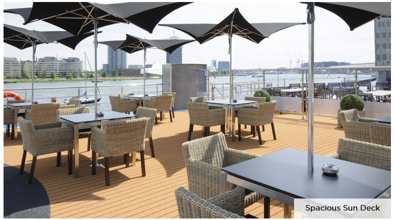
Spacious Sun Deck