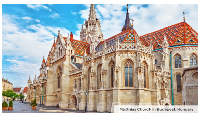
Matthias Church in Budapest, Hungary