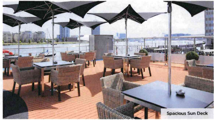
Spacious Sun Deck