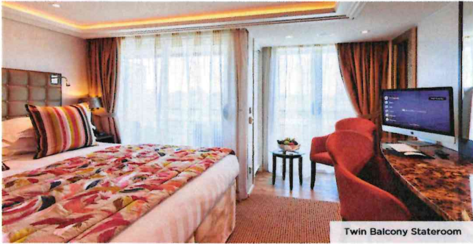
Twin Balcony Stateroom